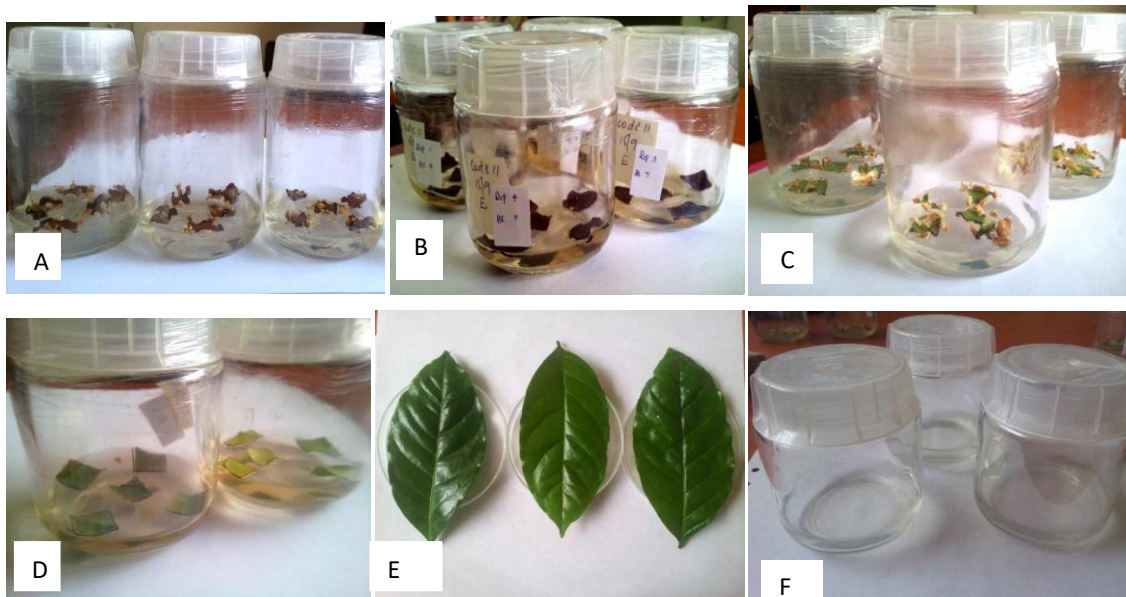
Plate 1: Treatment layout A: Brown leaf discs with embryos. B: brown leaf discs without embryos. C: green leaf discs with embryos. D: Green leaf discs without embryos, E: Fresh leaves (control). F: Fresh media (control)

Treatments for this experiment were selected from the remaining 444 clean cultures. Culture vessels with green and brown leaf discs with and without embryos as shown in Plate 1 were used to characterise caffeine, chlorogenic acid, amino acids, sucrose, glucose, fructose and phyto-components in the leaf discs, embryos and medium. Fresh culture media and leaf explants excised from greenhouse-grown mother plants were used as the controls. The experimental layout was a completely randomized design, with three replications and six culture vessels per treatment. The experiment was repeated once.