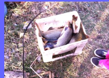
Conservation of biodiversity, energy and water for sustainable development

Chuka University is ISO 9001:2008 Certified