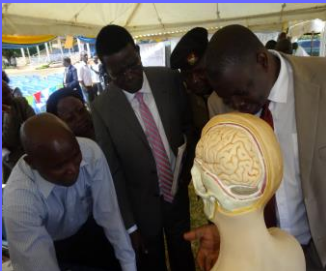
The role of arts, humanities and social sciences in sustainable development