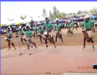
The role of arts, humanities and social sciences in sustainable development