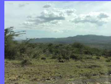
Conservation of biodiversity, energy and water for sustainable development