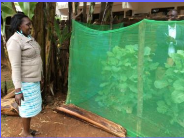
Revitalisation of agriculture and food security for sustainable development