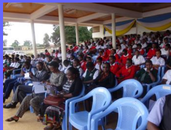
Harnessing affirmative action and gender equity for sustainable development