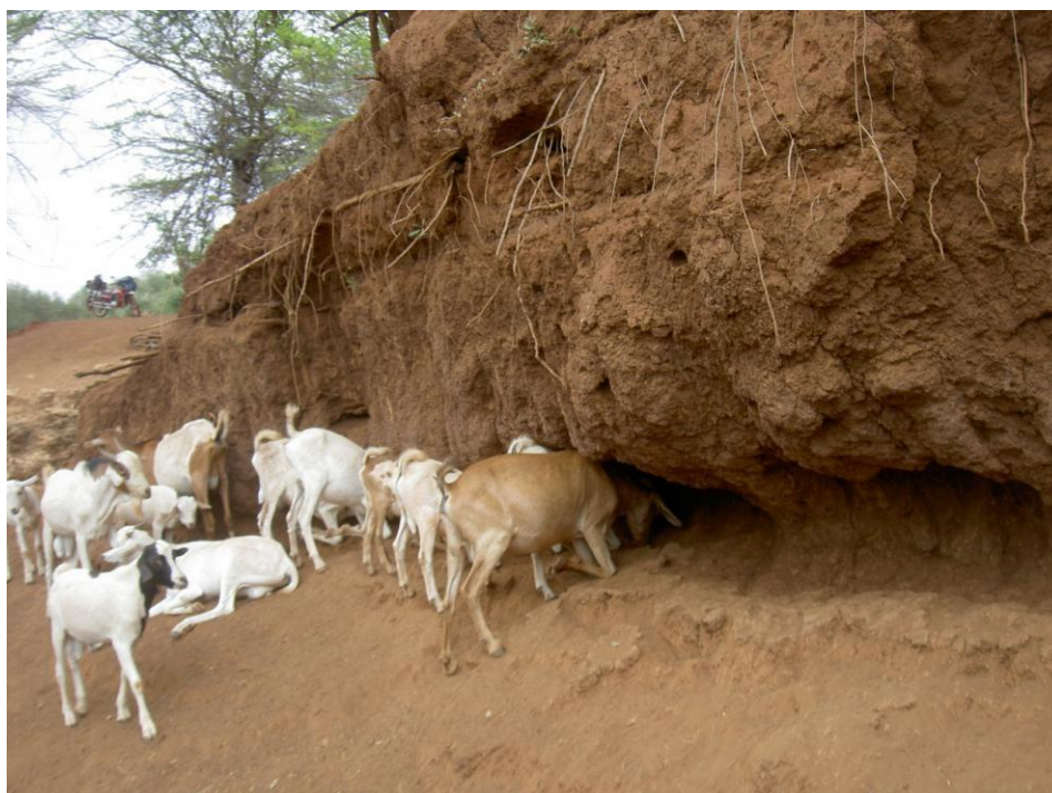
Figure 3: Goats consuming soils from a wall lick along a seasonal stream in Igambang'ombe Division, Tharaka-Nithi County

The wall licks (Kang'au, Kandondo, Gikurwe, Maara, Kabuai, Kigwanga, Riankui, M2, Kimenyi, Kieroo and Thuci) were found mainly along the banks of various seasonal streams in the study area as indicated in Fig. 3 below.