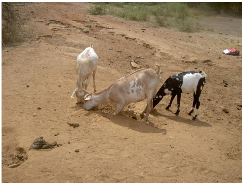
Figure 2: Goats consuming licks from an earth exposure lick in Igambang'ombe Division, Tharaka-Nithi County

Higher levels of potassium at Kibuuri lick may be associated with the natural weathering processes of the basement rocks and atmospheric deposition that is accompanied by low leaching effect due to high evaporation and low rainfall in the study area [37]. The absence of phosphorus in Kibuuri, Mikame and Ikindu licks might contribute to low energy metabolism in animals consuming the licks and hence causing depraved appetite in animals which makes them to abnormally consume inanimate objects like plastics [7]. The levels of cobalt were below detection limits in Nagundu and Kabariange licks, and this can interfere with the synthesis of vitamin B12 in ruminants that mainly depends on the soil lick from these sites as a source of essential minerals which might lead to emaciation and anemia in them. Animals can obtain all the essential minerals by mixing soil licks from Nagundu and Kabariange.