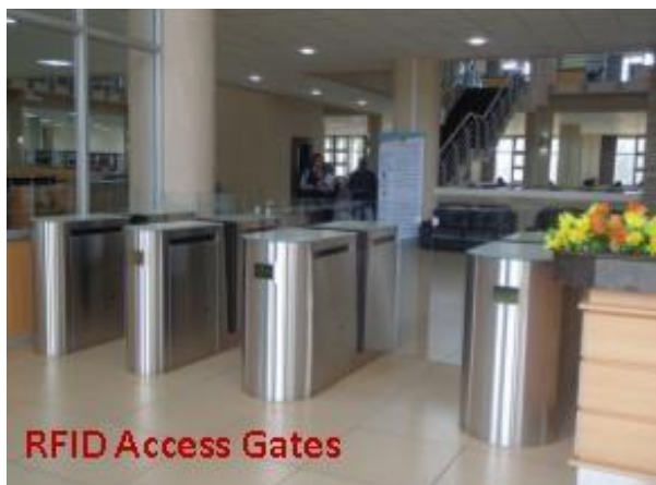
RFID Access Gates

The exits of RFID-enabled library is equipped with a RFID security gates look like standard securities in libraries but in this case have the capacity to emit sound alarms if the material has not been checked out (Palmer, 2006; Mehrjerdi; 2011).