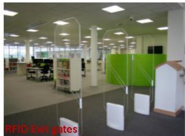
RFID Exit gates

Another component is the inventory wand which is a hand-operated used to scan library material on the shelves for the purposes inventory management, weeding, and finding misplaced materials. The inventory wand consists of scanners for use with RFID tags placed on materials and a PDA for processing. Most inventory wands can be connected to the library management system (LMS) via wireless or wired connection to process reconciliation lists in the case of missing or misplaced materials (Howard & Anderson, 2007; Seadle & Yu, 2008).