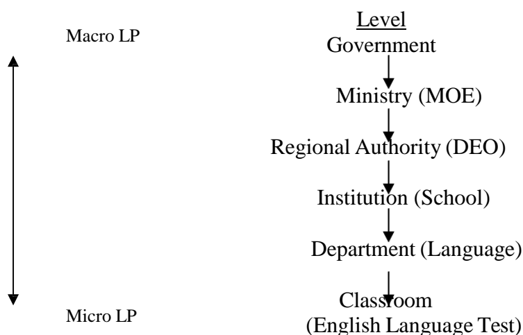
Figure 2: A representation of Macro and Micro goals

Input and learner variables are subject to planning. The decision to teach in, or not to teach in a particular language, may be a major planning decision. Motivation can be manipulated. For example, governments can decide to reward language proficiency by using language criteria in job requirements, giving language learning scholarships and opportunities for overseas study.