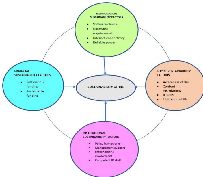
Figure 1: Proposed sustainable IR framework

Thus, the proposed IR sustainability framework tries to bring together in a pictographic form, ideas/concepts, the interactions between them, and their power of forecasting IR sustainability. The framework illustrated in Figure 1 below is grounded on the literature review, theoretical framework, study findings and recommendations.