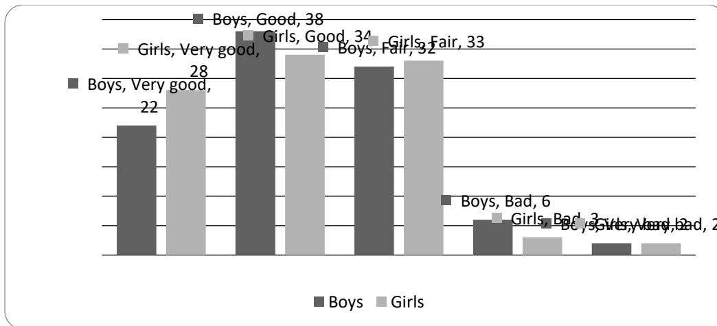
Figure 1: Rating Boys and Girls Interpersonal Relationships with Other People