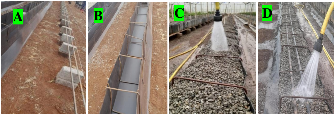
Plate 1. Raising of hydroponics planting beds (A), Reinforcing the Planting Troughs (B), Sterilizing the Media with Hydrogen Peroxide (C) and Stabilizing Planting Media pH with Phosphoric Acid (D)

The propagules were established through top-grafting at Olij Kenya (2A). The scion was obtained from the Red Rhodos bud woods and the rootstalk was from natal briar bud woods. After 28 days the plants were taken to the hardening bay. On the 36 th day plants were ready for transplanting (2B). Only disease and pest-free plants were selected for planting. The media was irrigated with plain water to help keep the beds wet during planting. Planting was done early in the morning using a spacing of 18.5 cm intra-row and 9.25 cm inter-row and 5 cm from the edge of the planting trough with each bed having 540 plants.