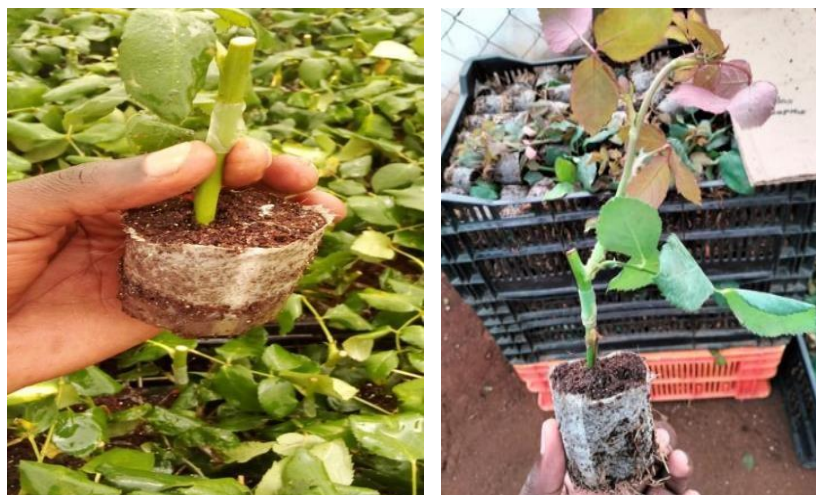
Plate 2. Top grafts after establishment in Olij Kenya (A) and Top grafts after 36 days (B)