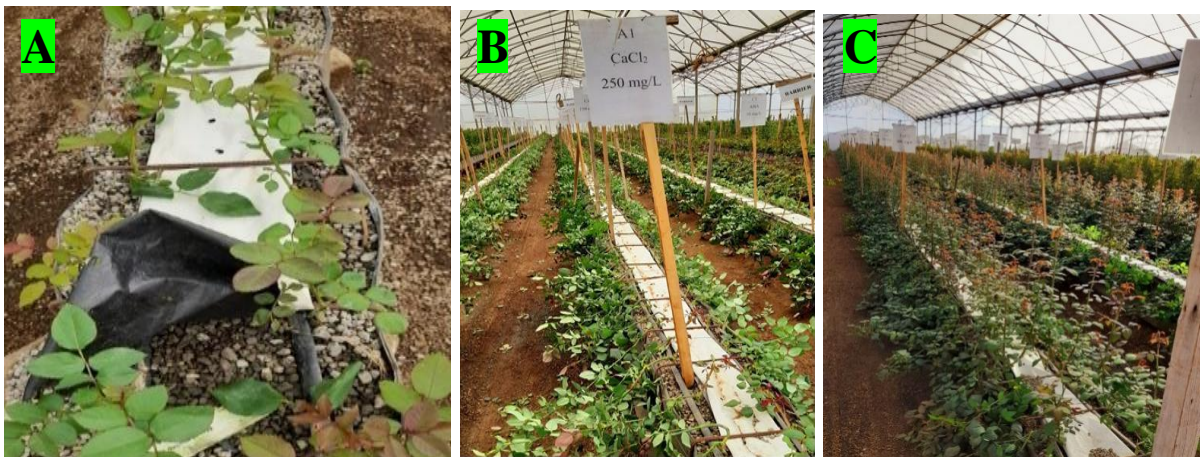
Plate 3. Plastic mulch (A), First Bending (B) and Selective Bending and Sanitation Done in the Greenhouse (C)

Weather monitoring was through an EL-USB-5 data logger. The data logger recorded greenhouse humidity, and temperature using a remote sensor and data collected daily. An automatic fogging system was installed in the greenhouse to manage in-house humidity. Fans were also installed in the greenhouse for enhancing air circulation. Greenhouse temperature was maintained between 23 °C - 30 °C during the day and 12 °C – 16 °C during the night. Humidity was maintained between 70 % and 80%. When greenhouse humidity was 65% and below, fogging was done for 6 seconds at an interval of 3 minutes until the appropriate greenhouse humidity was achieved.