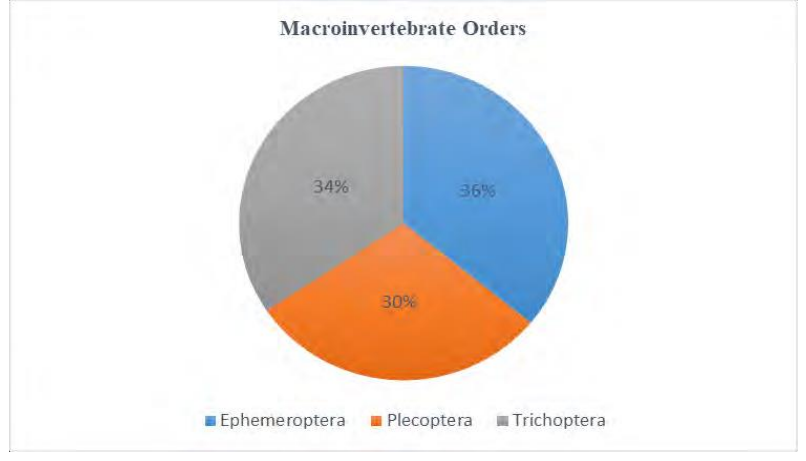
Figure 2: EPT Orders of Macroinvertebrates in River Naka.

Of the three Orders of interest, the Ephemeroptera Order had the highest species richness comprising 36% of the total samples that were collected, while the Order Trichoptera had slightly low species richness with 34% and the Plecoptera had the lowest species richness with only 30%. The Orders Ephemeroptera and the Trichoptera were observed at all the three sampling sites along River Naka though the River is not comprised of only three Orders. The upstream had the highest score of the EPT followed by the midstream and then the downstream.