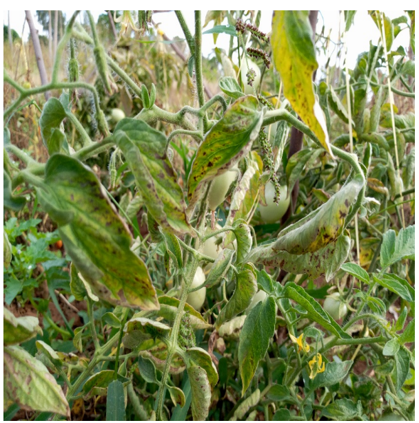
Figure 2: Bacterial leaf spottaken from Wanguru(Mwea)

A significant (p<0.05) variation in means of bacterial leaf spot occurredin all the tomato farms surveyed. Higher incidence was observed in farm 7 with mean of 16.000 % followed by farm 6 with mean of 14.667 %. the lowest incidence was recorded in farm 3 and 5 with mean incidence of 8.333 %. Five out of ten farms surveyed recorded means which were above general incidence mean of 11.828 % while the remaining farms had their means lower than the general mean (Table 2).