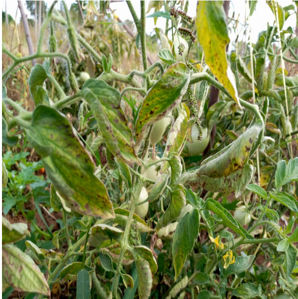
Figure 2: Bacterial leaf spottaken from Wanguru(Mwea)

A significant ( p < 0.05 ) variation in means of bacterial leaf spot occurred in all the tomato farms surveyed. Higher incidence was observed in farm 7 with mean of 16.000 % followed by farm 6 with mean of 14.667 %. the lowest incidence was recorded in farm 3 and 5 with mean incidence of 8.333 %. Five out of ten farms surveyed recorded means which were above general incidence mean of 11.828 % while the remaining farms had their means lower than the general mean (Table 2).