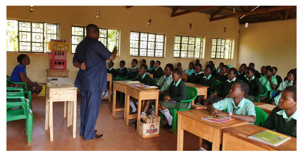
Figure 5: Kabuabua Girls' Boarding