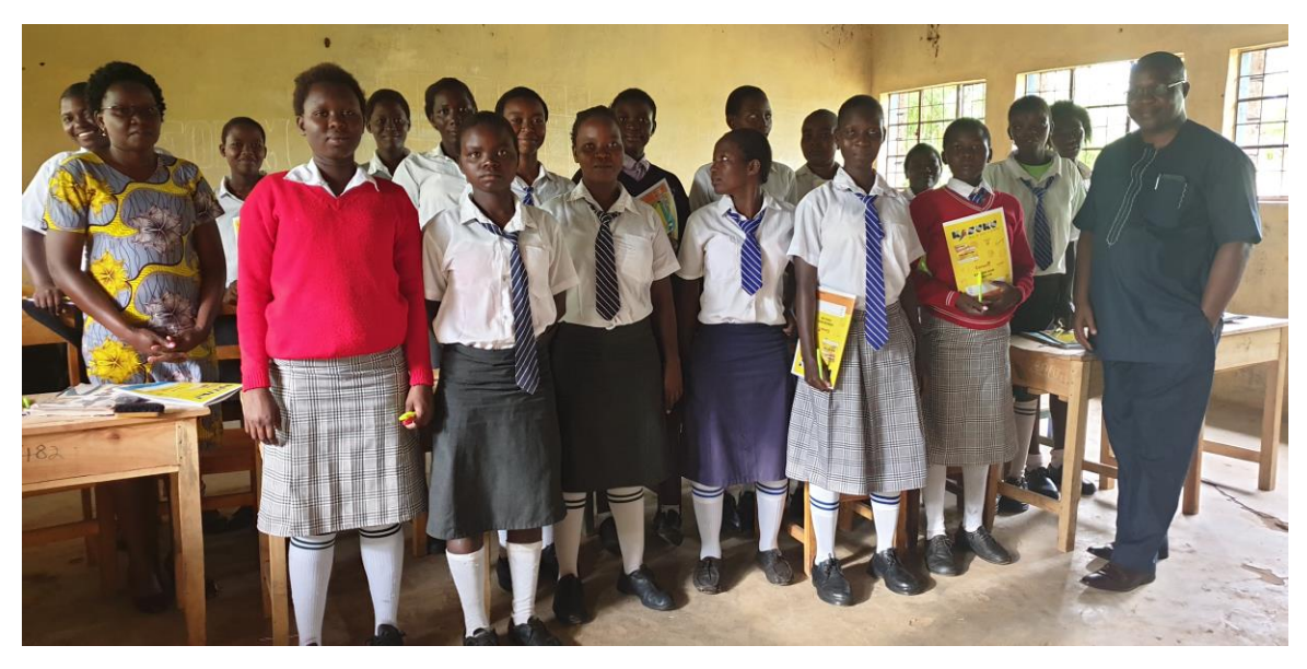
Figure 3: Gatue Day Mixed Secondary School