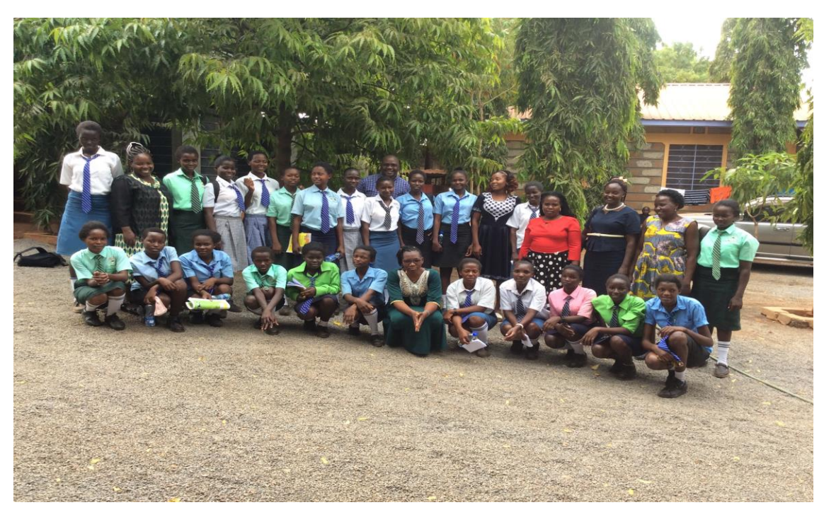
Figure 7: Representatives from the Five Schools during the Open Forum

The general idea in writing the narratives was to get the girls to tell their story; to share their recent experiences that is one week, month or two months ago. They were expected to keep a daily journal from when the clubs were formed which would be incorporated into their prior experiences when writing the narratives. The guidelines for writing used are consolidated in Table 1.