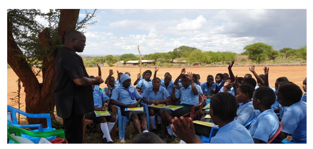
Figure 2: Kathangachini Day Mixed Secondary school