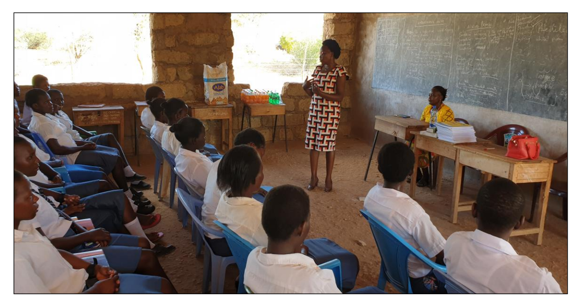
Figure 4: Kamacabi Day Mixed Secondary School