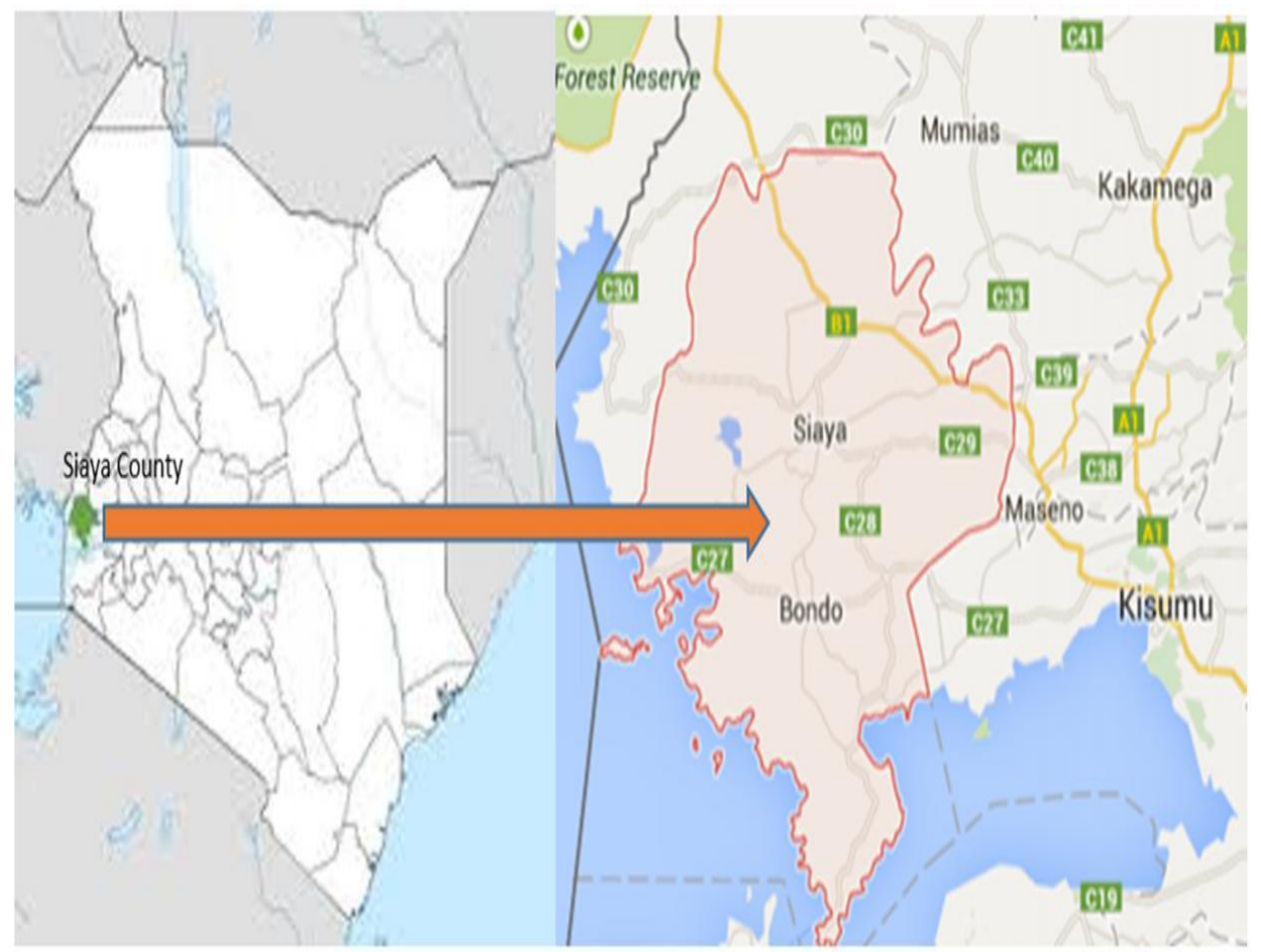
Figure1: Map showing Siaya County (Google map)